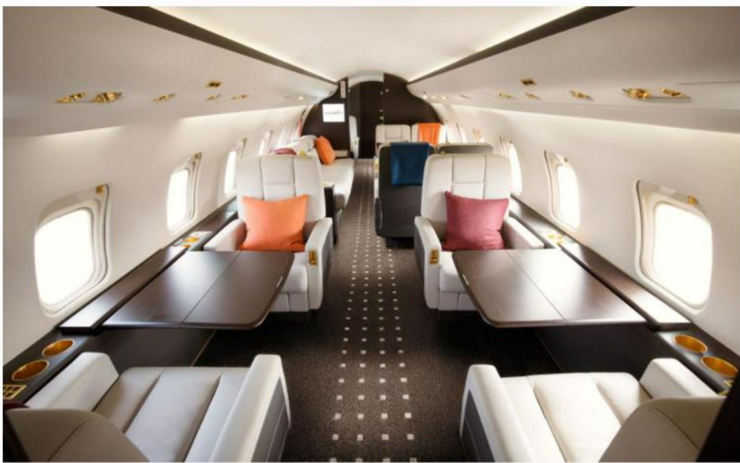
After the pandemic will more people fly privately? VISTAJET

In fact, VistaJet reports that flying privately as opposed to commercially lowers touch points from 700 possible interactions to just 20.