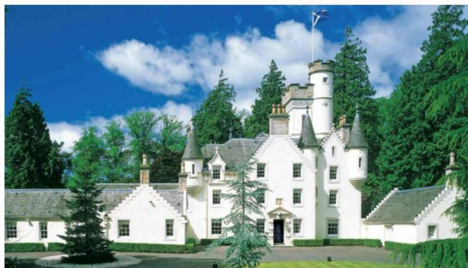
Stay at a private castle PITTORMIE CASTLE, SCOTLAND WITH THE EDEN CLUB

Other experiences include island dreams in Jamaica with Entourage Travel, a vineyard tour through Chêne Bleu, in France, or even a stay in a private castle in Scotland.