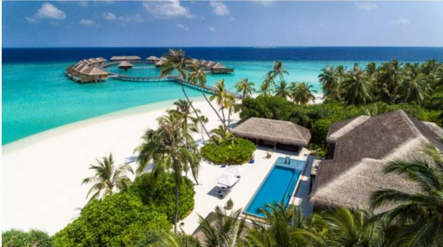
Velaa Private Island VISTAJET

Expect a private butler on hand to cater to your every whim in one of 47 private villas, 18 of which are suspended over water. Celebrities or just those who crave total privacy will love the Romantic Pool Residence which provides ultimate seclusion and can only be reached by boat.