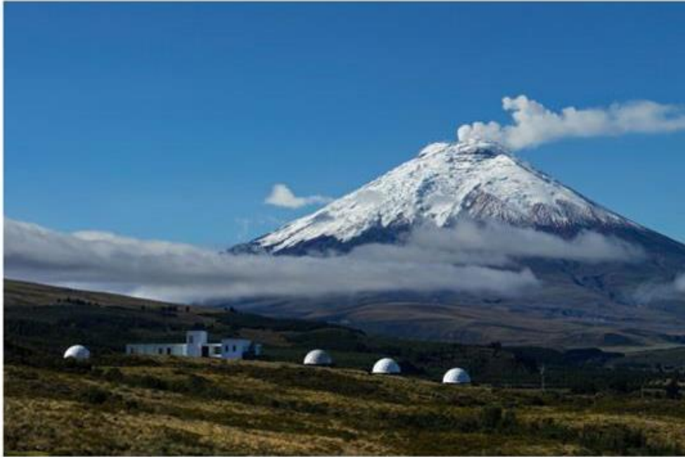
Cotopaxi Sanctuary Lodge, in the volcano region of Ecuador.