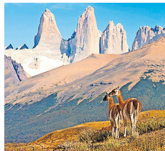
Guanacos in Chile, above; beachside in Bahia, Brazil, left; cycling in Argentina's Lake District, far left; Torres del Paine National Park, Chile, below

A fruit seller in Cartagena, Colombia, left; Peruvian cuisine; see the Moai statues on Chile's Easter Island, right